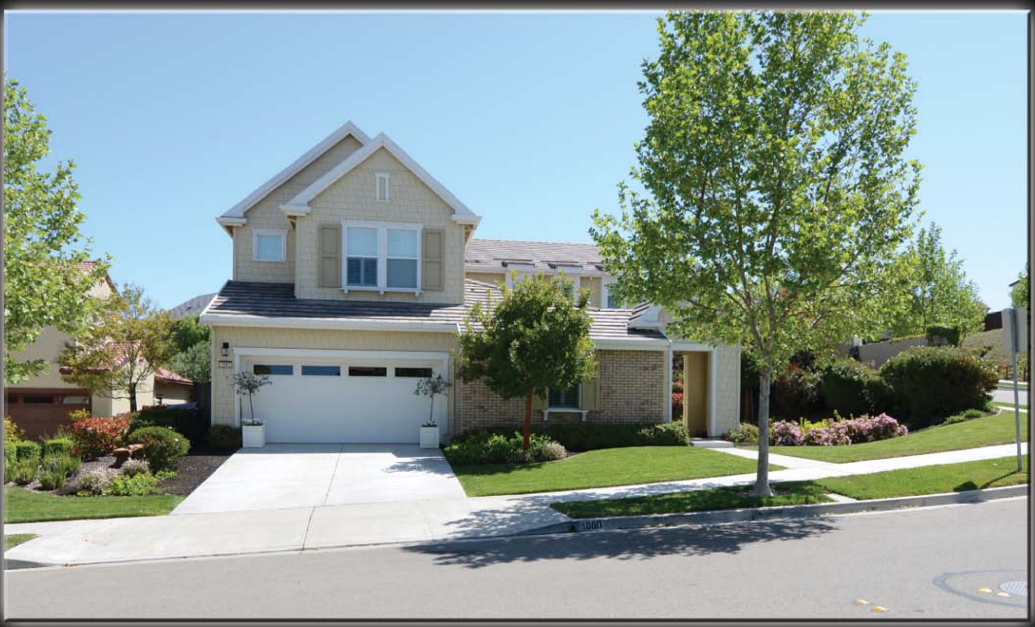
1000 Chancery Way San Ramon